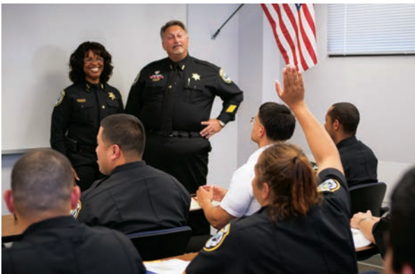
OCCD'S DEPUTY CHIEFS SPEAK TO A CLASS OF CADETS

The Criminal Justice Institute at Valencia College is one such academy for qualified candidates. The academy is certified by the Florida Department of Law Enforcement. The 12-week academy includes 420 hours of coursework and practical application, offering students an introduction into criminal justice, defensive tactics, physical fitness training, weaponry, techniques for first responders, communication and interpersonal skills training, as well as an overall introduction into correctional operations. After successfully completing the academy, students are offered an opportunity to take the state examination to become certified correctional officers. Candidates who already maintain a valid certification in another state are encouraged to reach out to the agency's Human Resource Division directly to learn more about how to transfer a certification.