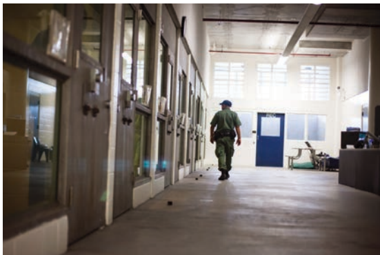
SPECIALIZED DORMS HOUSE ACUTE MENTAL-HEALTH INMATES

There are also three courtrooms housed at the agency's Booking and Release Center where correctional officers provide courtroom security, while civilian staff ensure judiciaries have access to critical information. Located in close proximity to the secure compound are the agency's Video Visitation and Work Release Centers. With public safety such a global topic in Orange County, OCCD leaders are proud to remain at the forefront of discussions pertaining to how to best protect the community.