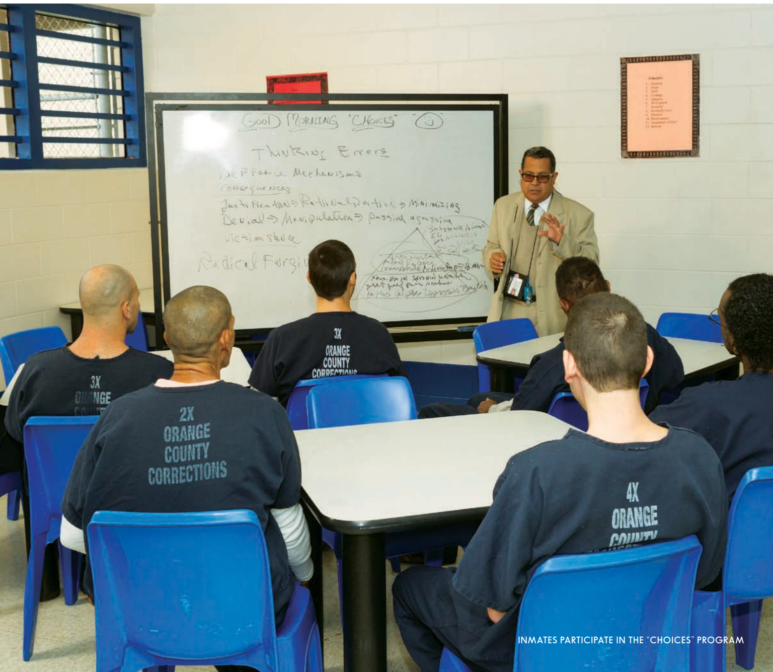
INMATES PARTICIPATE IN THE "CHOICES" PROGRAM