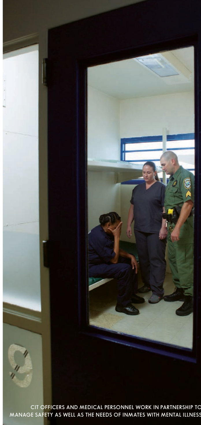
CIT OFFICERS AND MEDICAL PERSONNEL WORK IN PARTNERSHIP TO MANAGE SAFETY AS WELL AS THE NEEDS OF INMATES WITH MENTAL ILLNESS