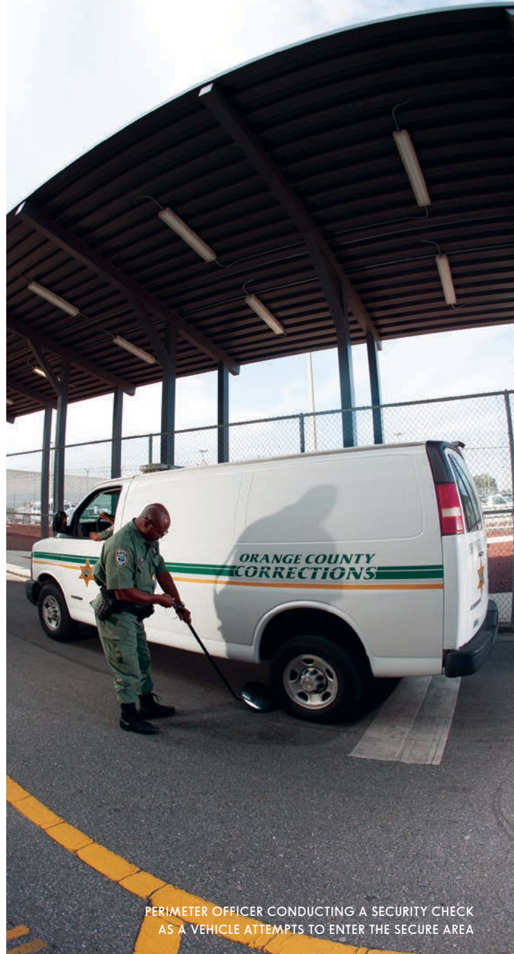
PERIMETER OFFICER CONDUCTING A SECURITY CHECK AS A VEHICLE ATTEMPTS TO ENTER THE SECURE AREA