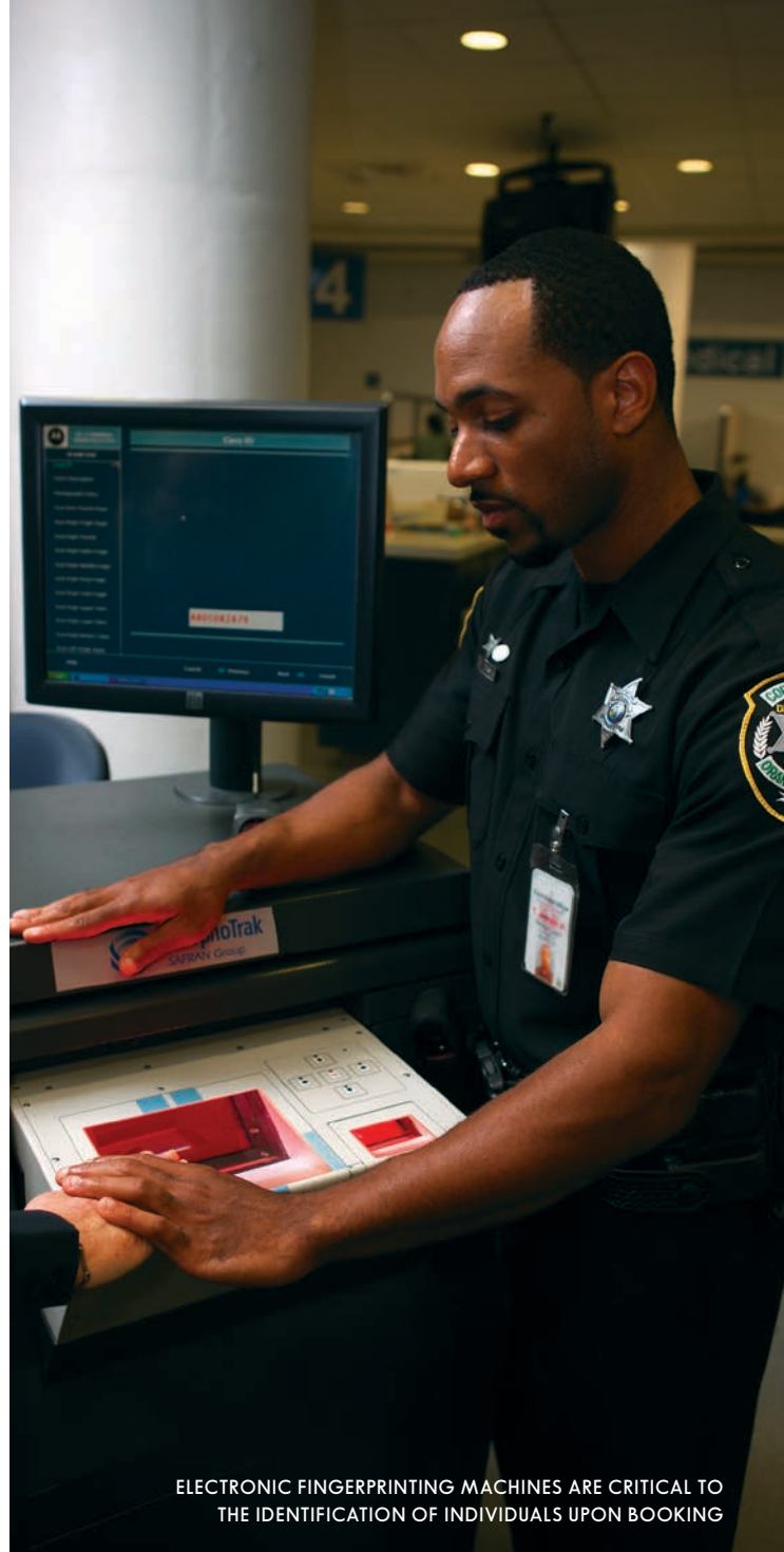
ELECTRONIC FINGERPRINTING MACHINES ARE CRITICAL TO THE IDENTIFICATION OF INDIVIDUALS UPON BOOKING