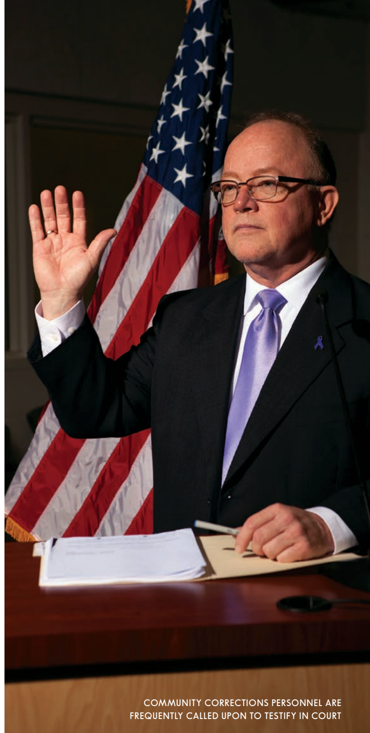
COMMUNITY CORRECTIONS PERSONNEL ARE FREQUENTLY CALLED UPON TO TESTIFY IN COURT