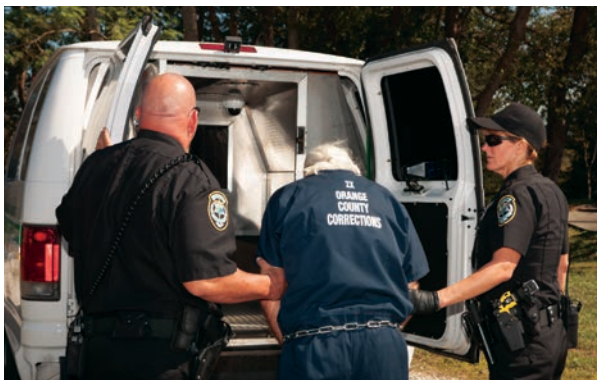
TRANSPORTATION UNITS WORK TO MOVE MORE THAN 100 INMATES ON AN AVERAGE DAY

The Security Support and Security Operations Divisions include several specialty units, each charged with unique that help preserve the safety and security of the compound. The Special Response Team is one such unit who is called upon to respond to unstable or critical events within the facility or to transport a high-custody-level inmate. CIT (Crisis Intervention Training) is another example of how civilian and certified personnel work together to accomplish unified goals, with more than 500 staff successfully completing the program. CIT helps prepare staff to work with inmates in crisis or those with mental-health needs, while working alongside medical professionals.