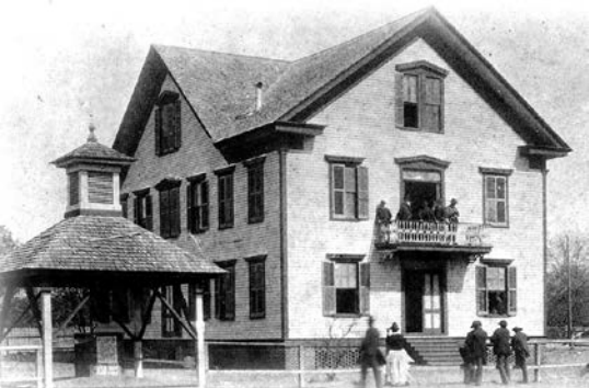
FIRST COURTHOUSE/JAIL CIRCA 1873, ON THE CORNER OF MAIN STREET AND CENTRAL AVENUE