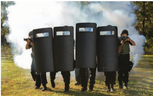
TRAINING EXERCISE FOR THE SPECIAL RESPONSE TEAM

Correctional officers regularly participate in ongoing training opportunities to maintain skills, as well as develop new ones.