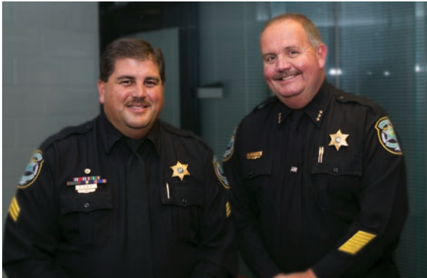
OCCD SERGEANT AND HIS BROTHER, A RETIRED ACTING DEPUTY CHIEF, FOLLOWED IN THEIR FATHER'S FOOTSTEPS

From what was once a handful of cells, the Orange County Corrections Department (OCCD) has become one of the largest county detention facilities in the nation. Situated on a 76-acre secure compound in Orlando, Florida, OCCD has the capacity to detain up to 4,100 inmates on any given day. Strong working relationships between the 1,700 certified and civilian staff are valued at OCCD, as is the rich history and proud tradition passed down through the many generations of employees.