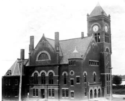
COURTHOUSE/JAIL CIRCA 1884