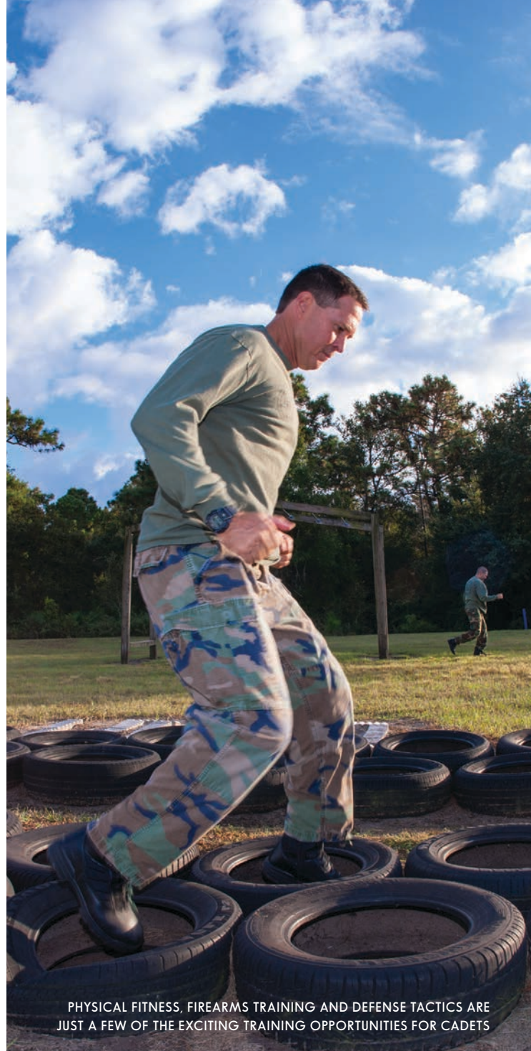
PHYSICAL FITNESS, FIREARMS TRAINING AND DEFENSE TACTICS ARE JUST A FEW OF THE EXCITING TRAINING OPPORTUNITIES FOR CADETS