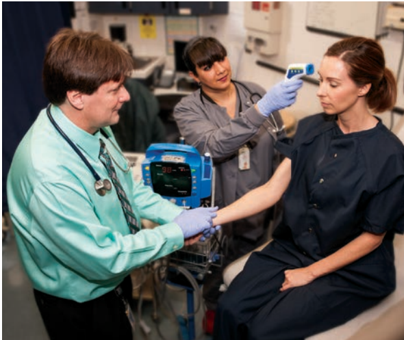
ORANGE COUNTY'S CORRECTIONS HEALTH SERVICES DIVISION EMPLOYS MORE THAN 150 MEDICAL PROFESSIONALS

The Orange County Corrections Department prides itself as an industry leader with such re-entry programs to include a veterans' dorm where correctional officers with military backgrounds supervise inmates who meet a select criteria and have been honorably discharged. These officers work in partnership with program and mental-health professionals. In addition, OCCD has an expansive Health Services Division. Although an independent division, medical professionals work seamlessly with OCCD staff. Along with these unique services, OCCD also has the largest Female Detention Center in the area.