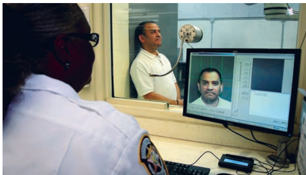
INMATE RECORDS MANAGEMENT STAFF CAPTURE AND UPLOAD BOOKING PHOTOS