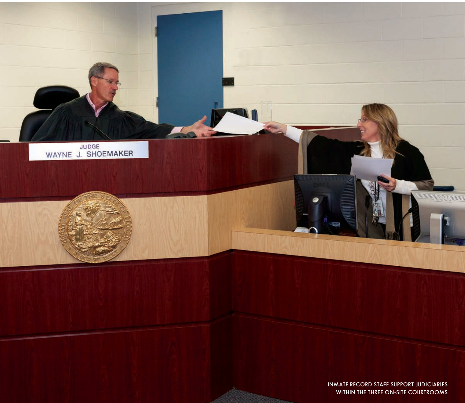
INMATE RECORD STAFF SUPPORT JUDICIARIES WITHIN THE THREE ON-SITE COURTROOMS