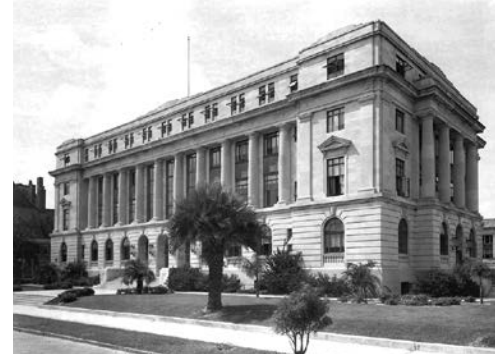
COURTHOUSE/JAIL CIRCA 1927, ON THE CORNER OF WALL STREET AND COURT STREET