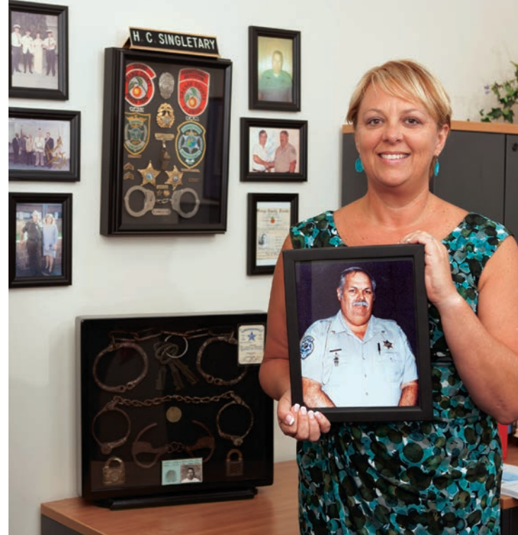
ADMINISTRATIVE ASSISTANT, WHOSE FATHER RETIRED FROM OCCD, PROUDLY DISPLAYS MEMORABILIA IN HIS HONOR