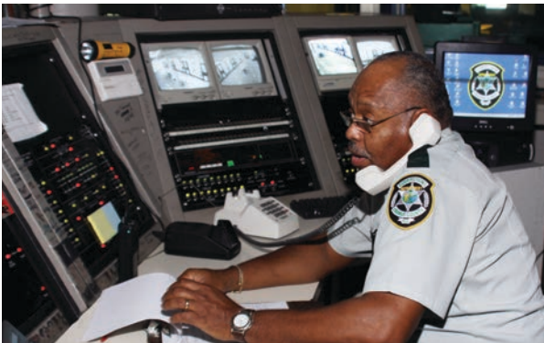
DETENTION SERVICE OFFICER STATIONS ALLOW PERSONNEL TO SAFELY MOVE INMATES AND MAINTAIN VISUAL/AUDIO CONTACT

The Command Center houses state-of-the-art technology that serves as extra eyes and ears – a critical tool for maintaining safety and security. This is just one example of how innovation is present at OCCD. The agency was also one of the first in the nation to implement a Video Visitation Center, which drastically reduced the introduction of contraband into the facility. Today, the agency is constantly seeking new technologies to enhance staff performance, as well as keep personnel, visitors, inmates and the community safe.