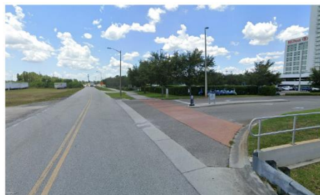
Tradeshow Boulevard looking south.

Included as part of the International Drive Transit Feasibility and Alternative Technology Assessment (TFATA) was an evaluation of the potential to implement improvements to Tradeshow Boulevard, to include the addition of vehicular travel lanes and transit lanes between Destination Parkway and Universal Boulevard. Kirkman Road is being extended south of Sand Lake Road and will end at the intersection of Tradeshow Boulevard and Universal Boulevard. The road was designed as a six-lane general use roadway with two dedicated transit lanes. The existing two-lane Tradeshow Boulevard will be over capacity once the Kirkman Road improvements are completed. Procurement of engineering design consulting services commenced in FY21.