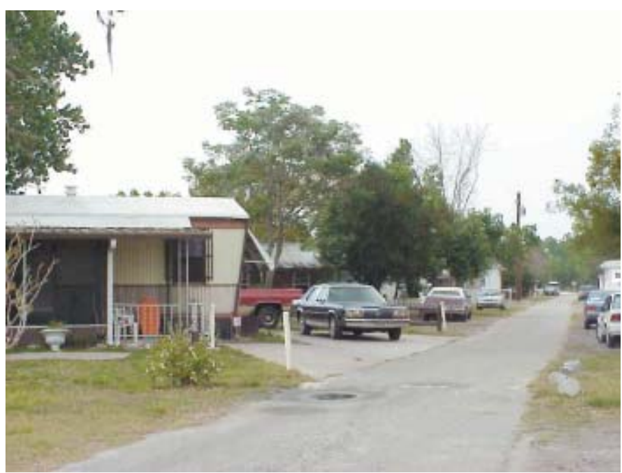
Mobile homes in Sunflower Trail

housing options. While affordable housing is promoted with density incentives in the FLU Element, the lack of central water and sewer services to accommodate density renders the policy inconsistent with other FLU policies intended to preserve traditional rural densities. This inconsistency is not reconciled in current policies, nor is the inconsistency of choices made to extend or not to extend services to particular areas, such as the Cypress Lakes Planned Development in east Orange County, which was a condition of approval prior to the adoption of the Orange County 1990-2010 Comprehensive Policy Plan (CPP) in 1991.