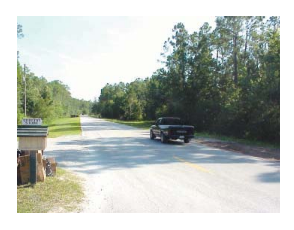
A scenic corridor along Lake Mary Jane Road