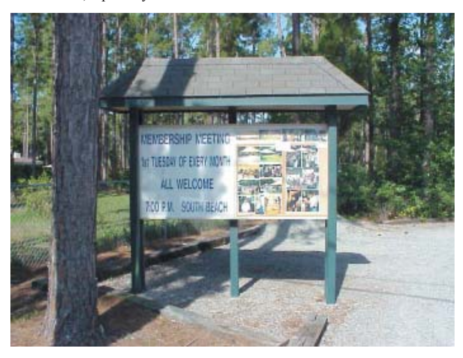
A community bulletin board at a store in Lake Mary Jane

Another amenity helping to create a sense of place is the West Orange Trail. The first phase built five miles of fourteen-foot-wide paved trail from the county line near County Road 438 to Winter Garden. The second phase extended the trail to U.S. Highway 441 in Apopka. The final phase will extend the trail to Wekiwa Springs State Park. As well as contributing to the historical character of these areas, this type of facility also contributes to the local economy as a destination for residents and tourists. The trail preserves scenic vistas in West Orange County, and the inclusion of horse trails in the facility recognizes the importance of equestrian activity to many rural residents, especially in the Clarcona area.