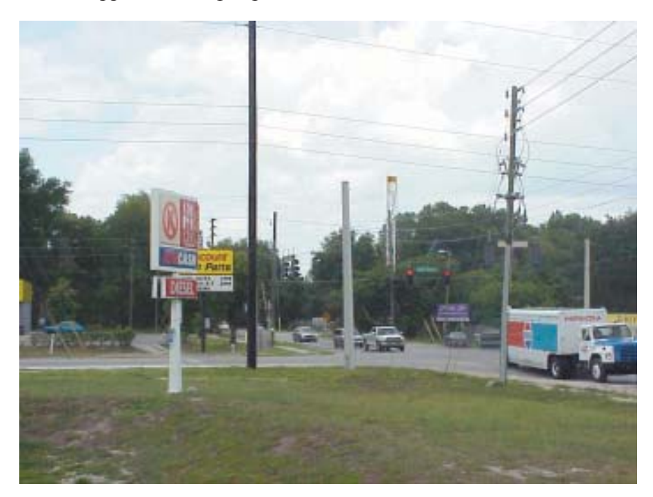
A commercial area at the intersection of Clarcona-Ocoee Road and Apopka-Vineland Road

The implementation of a zoning overlay district could focus on the major intersections recommended for additional standards, similar to the intersection of Gotha Road and Hempel Avenue. A zoning district overlay applied to these areas could also protect scenic roadway corridors found abutting many of these intersections, including along Hempel Avenue and Clarcona-Ocoee Road. As an example, the North Apopka/Wekiva Small Area Study proposed scenic corridor preservation be added to the Land Development Code, suggesting greater building setbacks, preservation of vegetative buffers, signage control, meandering driveways to block views of structures, and alternative corridor widths of 100 feet from the centerline (Glatting et al. 1992). Implementation of an overlay district on a test basis in selected Rural Settlement areas, based in part on staff assessment and resident support, will help to preserve the rural character of these areas.