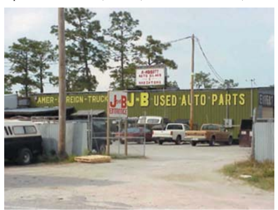
An automobile-related business in Bithlo, characteristic of the area

Consistent with adopted FLU policies, many of the commercial uses found in Rural Settlements are small retail operations, such as convenience stores. Exceptions are found in Bithlo, Zellwood, and other Rural Settlements, with more