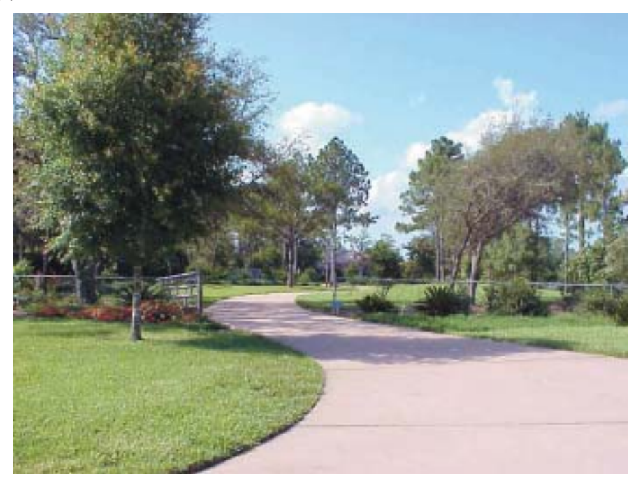
A large-lot home in Lake Whippoorwill/Hart, developed in conventional suburban style

The Orange County's Evaluation and Appraisal Report (EAR) noted that "existing agriculture and rural land use and zoning classifications and the intensities and densities of land use maintain the rural character". Traditionally, an aspect of rural character has been considered to be the presence of large-lot homes. The presence of large lot homes in rural areas allowed various agricultural activities, such as the keeping of livestock, to take place. While these activities continue to take place in some Rural Settlement areas, other owners do not pursue agricultural lifestyles. These owners have built under large-lot densities in ways that do not maintain rural ambiance. While diversity in housing choice is an important value that should be preserved, the choice of owners not to develop in a traditional rural manner points to the need to have alternative mechanisms to preserve rural character.