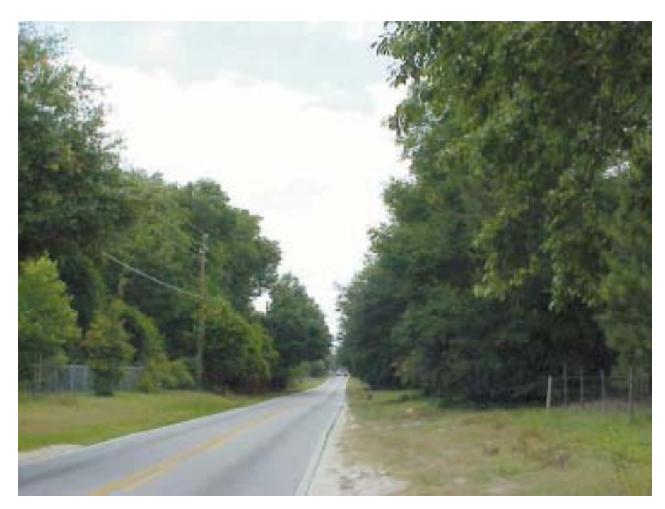
A scenic corridor along Clarcona-Ocoee Road west of the Apopka Vineland intersection in Orange County

important proactive step toward avoiding confrontation, as development proposals for property within Rural Settlements continue to be received from the private sector.