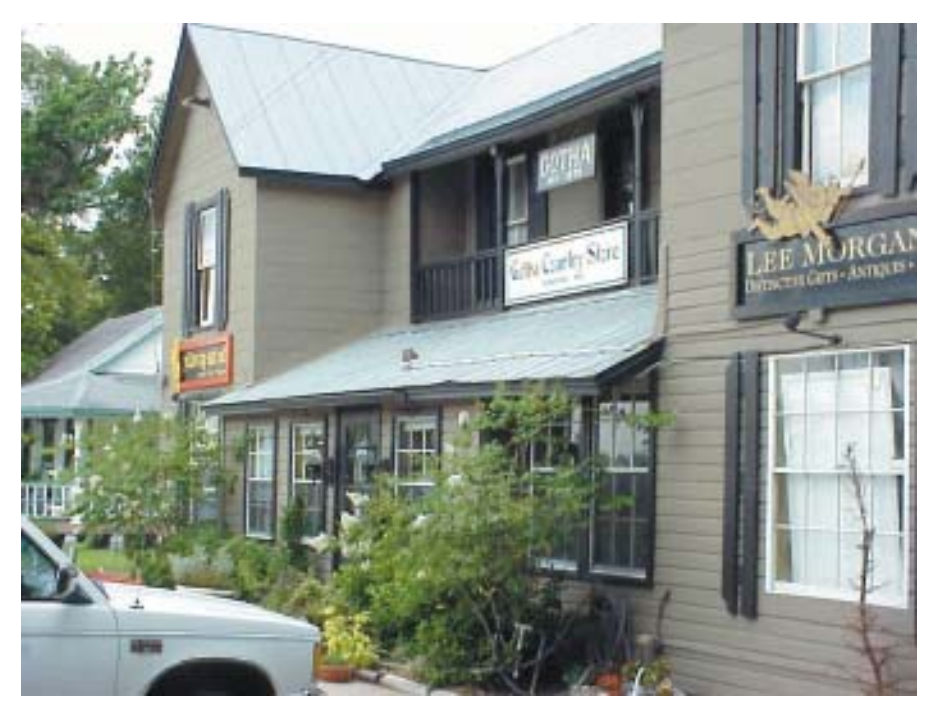
Gotha Country Store

intense commercial uses, like auto-related businesses. Some of these businesses are vested, nonconforming uses operating inconsistent with the future land use and zoning designations applied to their property.