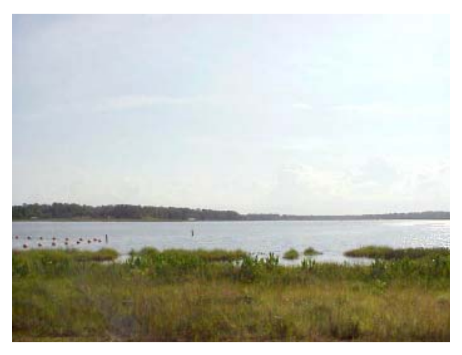
Lake Hart in south Orange County

residents use wells and septic tanks. Finally, central water service and a small package plant serve Zellwood Station, which was approved before CPP adoption in 1991.