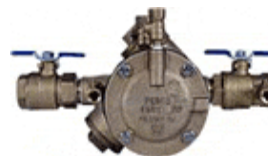
RP Backflow Device standard ASSE 1013

Customer is to schedule an inspection by a plumbing inspector by calling 407-836-5550 prior to using the irrigation system.