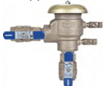
PVB Backflow Device standard ASSE 1020