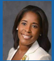
DISTRICT 6 COMMISSIONER VICTORIA P. SIPLIN