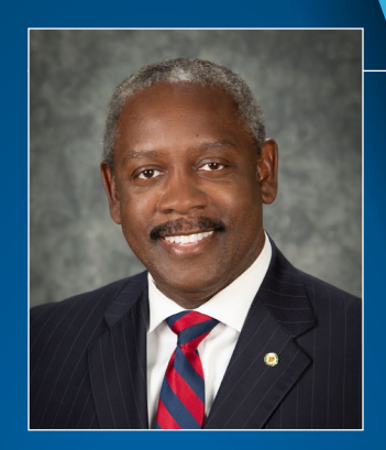
Orange County Mayor Jerry L. Demings