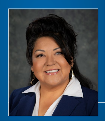
District 3 Commissioner Mayra Uribe