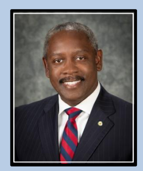
Orange County Mayor Jerry L. Demings