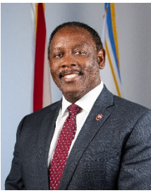
Orange County Mayor: Jerry L. Demings